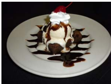
Brownie Sundae $4.50 A warm Brownie topped with a scoop of Vanilla Ice Cream, Chocolate Sauce, and Whipped Cream.