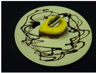
Mango Raspberry Pastry $4.95 Soft Cake layered with Raspberry Filling and Mango Mousse.