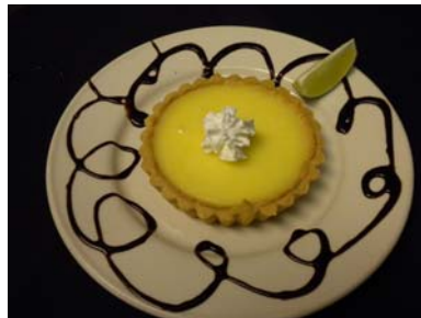
Key Lime Tart $4.95 A light tart shell containing a Buttery Lime filling with a hint of Vanilla. Topped with Whipped Cream.