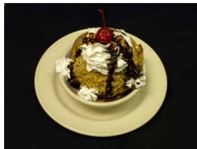
Fried Ice Cream $6.95 A mound of creamy vanilla ice cream covered in Granola and deep fried to perfection. Topped with Whipped Cream and Chocolate Sauce.