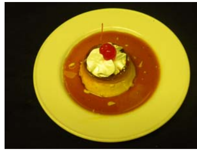
Tortilla Flats Homemade Caramel Flan $4.95 Delicious Caramel Flan. Our Most Popular Dessert!